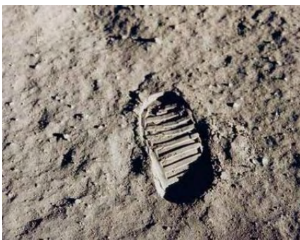
Footprint of Apollo 11 astronaut Buzz Aldrin on the moon.

Fly with an FAA Certificated Flight Instructor - you fly the aircraft!