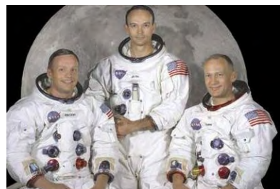
Apollo 11 astronauts Neil Armstrong, (L) who was the Mission Commander, Edwin "Buzz" Aldrin, (R), who was the Lunar Module Pilot, and Michael Collins, (C) who was the Command Module pilot.