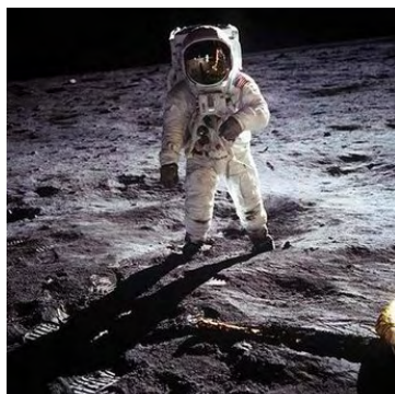
Apollo 11 U.S. astronaut Buzz Aldrin standing on the Moon, next to the Lunar Module "Eagle."