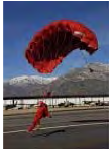
HAROLD FREDERICK LEICHER September 19, 1948 - October 11, 2008